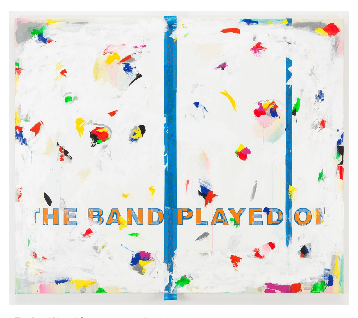
.The Band Played On #1, 2014. Acrylic and tape on canvas, 70 x 59 inches.