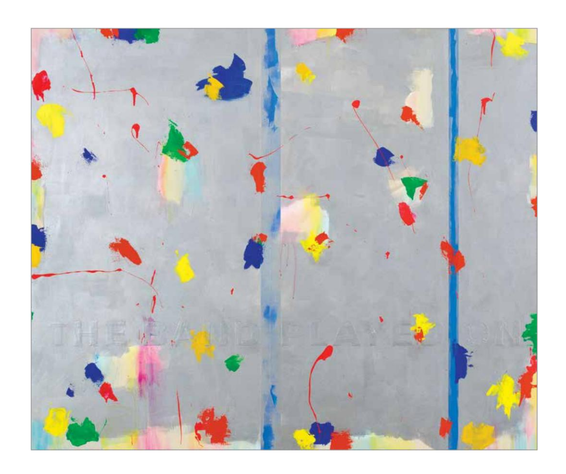
The Band Played On #2, 2014. Acrylic and tape on canvas, 60 x 72 inches.