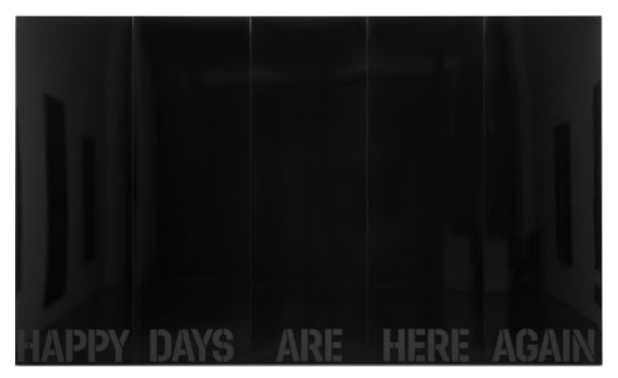
Happy Days, 2013. Oil and automotive urethane paint on canvas, 72 x 120 inches.